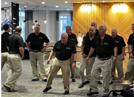
We had a great Sunday with the Catoctones!!