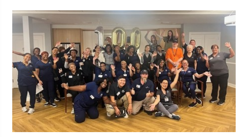
Our team celebrating a HUGE milestone!