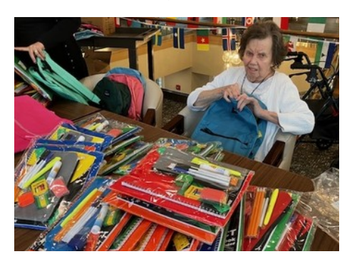
Our residents love helping us stuff our backpacks for the annual SageLife Associate Backpack Giveaway!